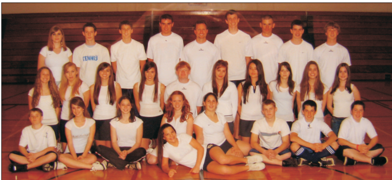
The 2006-2007 Amador Buffaloes League Champion Tennis Team.

Both Argonaut and Amador have joined the USTA's "No Cut Coaching" initiative. These coaches play a critical role in our sport by allowing young players the opportunity to participate on a team with their friends while representing their school. We applaud our local coaches for this effort!